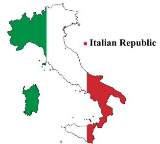
• Italian Republic