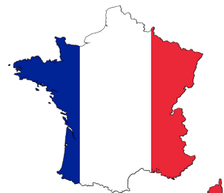
• French Republic