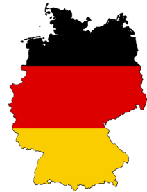
• Federal Republic of Germany