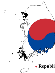
• Republic of Korea