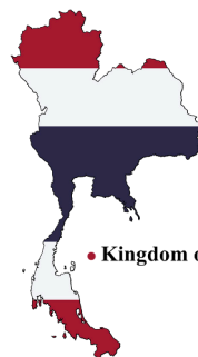
• Kingdom of Thailand